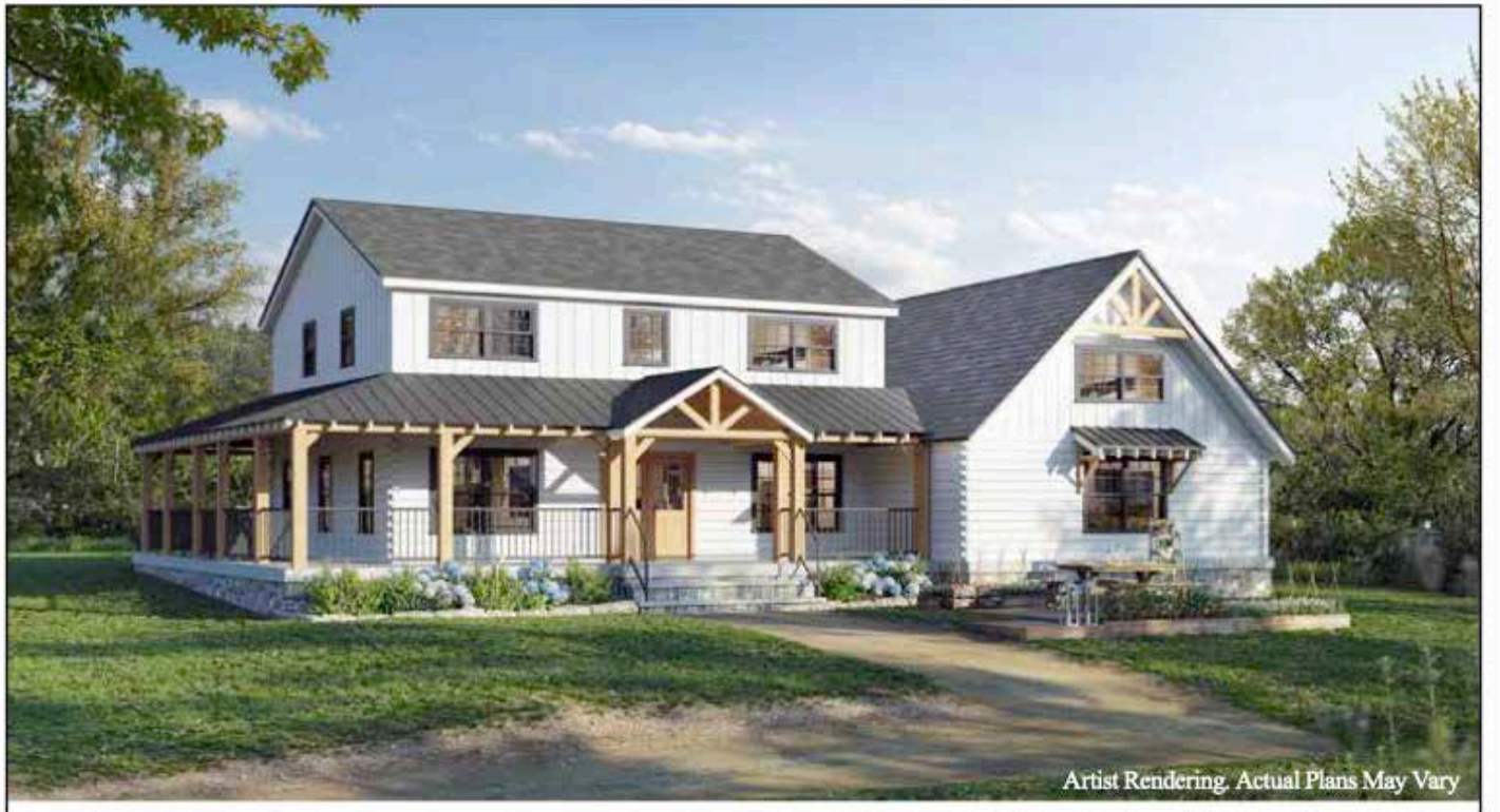
Artist Rendering. Actual Plans May Vary